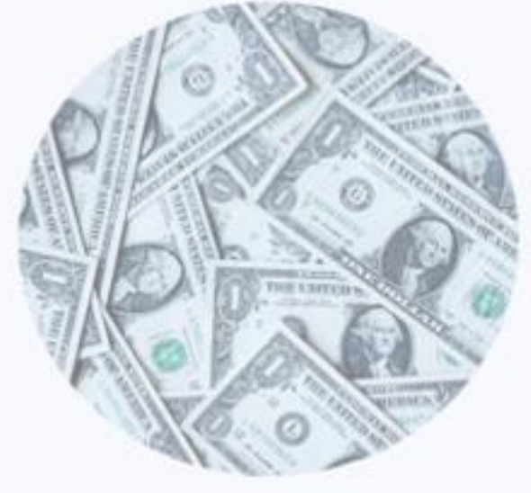
State Disbursement Units