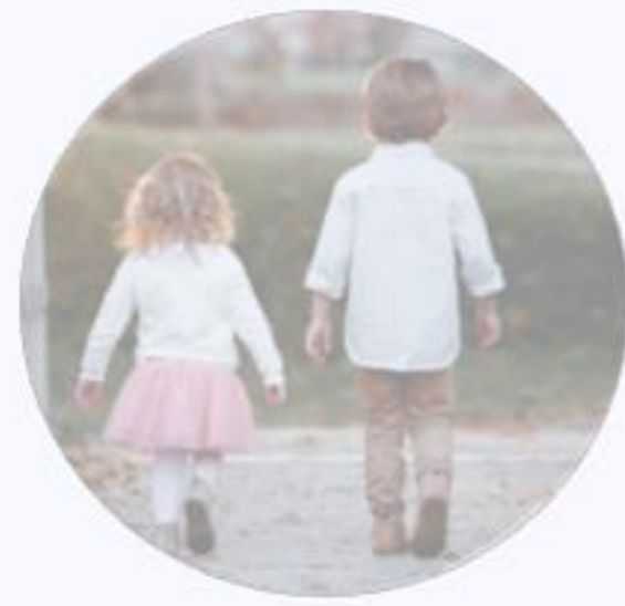
Child Support Enforcement